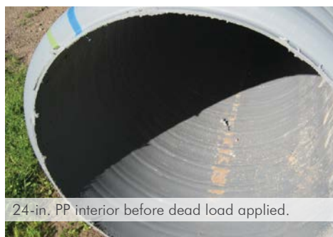
24-in. PP interior before dead load applied.