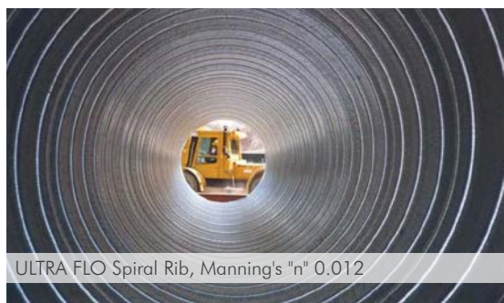
ULTRA FLO Spiral Rib, Manning's "n" 0.012