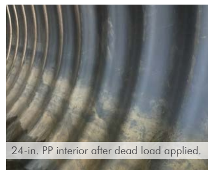
24-in. PP interior after dead load applied.