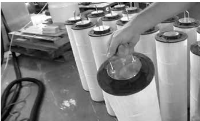
5. Once cleaned, install back into the vault. This completes maintenance. Ensure access lids are properly replaced.