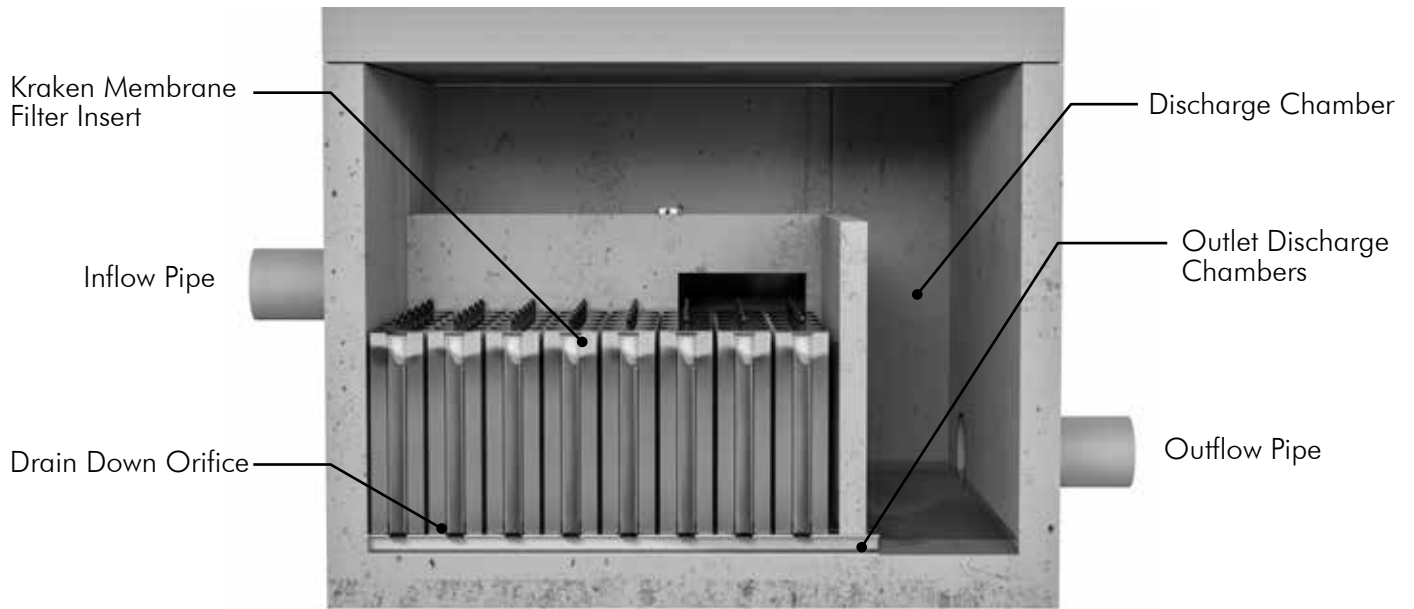
Filtration Chamber Cross Section