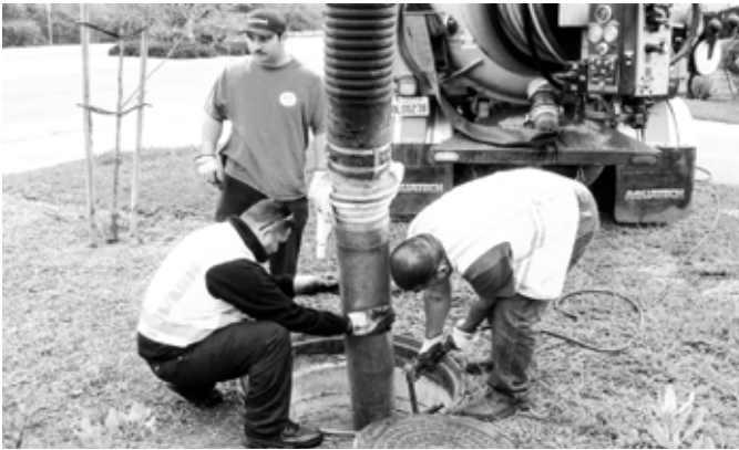
1. Remove access hatches set up vacuum truck to clean the pretreatment chamber.