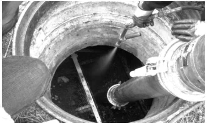
2. Insert vacuum hose in the sedimentation chamber and vacuum out all trash, sediment and standing water.