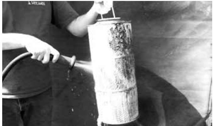
4. To wash cartridges, remove from vault. Place over trash can and use a garden hose to spray clean.