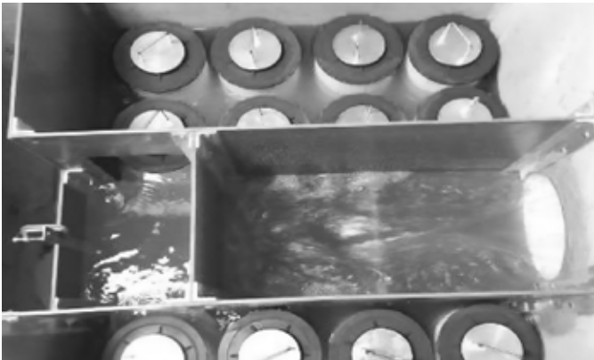
3. Assess the condition of the filter cartridges and determine if cleaning is required.